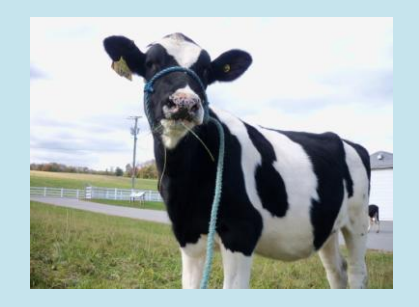
One of UConn's Dairy Cows