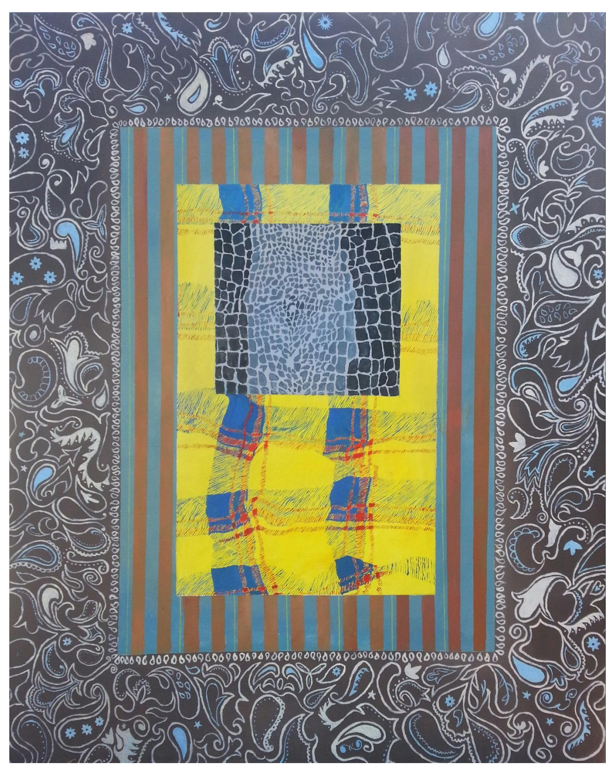
A Well Dressed Cowboy, Oil