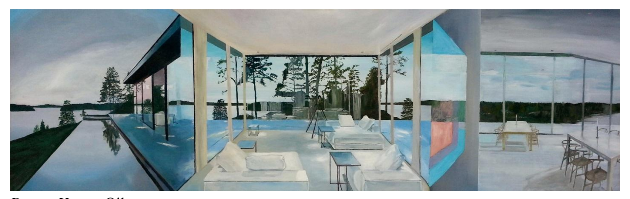
Dream House, Oil

It might be evident that most of my work stems from a "country-western" theme, however, I also contemplated majoring in architecture, another interest of mine, which is often the subject of my work. I have also painted some abstracted pieces dealing with color and pattern. Other pieces hold social commentary outside of the animal science sphere.