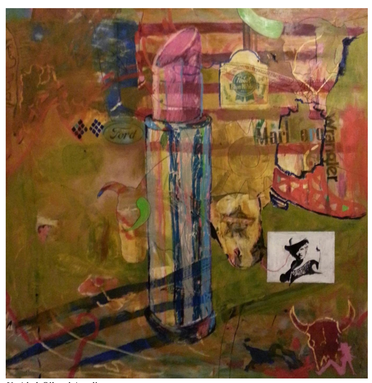
Untitled, Oil and Acrylic