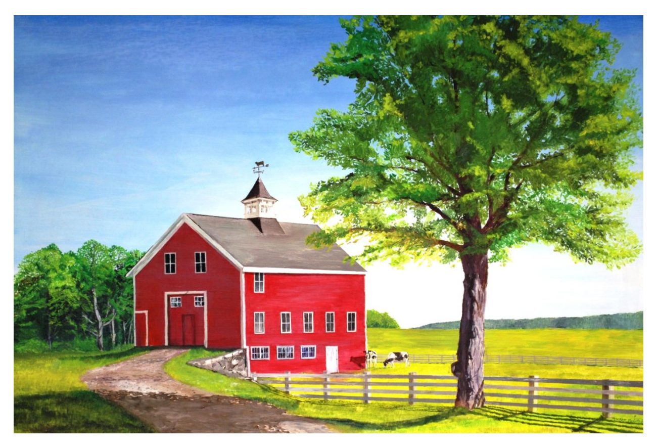
Below, \ two \ paintings \ created \ specifically \ for \ the \ UC onn \ Department \ of \ Animal \ Science \dots