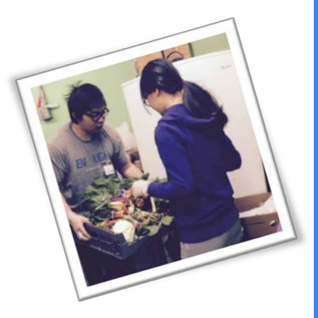
ANSC Graduate students at the Covenant Soup Kitchen