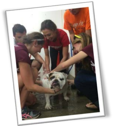
Pre-Vet Club members at the fall 2015 dog wash

Overall all three groups had an amazing time and the club is looking forward to sending more students with World Vets next year!