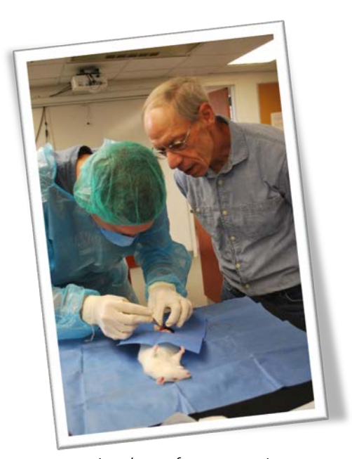
A student performs a castration on a rat in Lab Animal class

The Department of Animal Science is offering several courses during the 2016 summer intersession. The following courses will be available this summer: