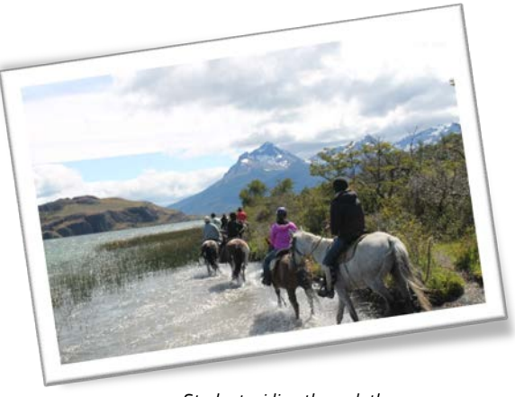
Students riding through the Chilean countryside