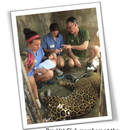
Pre-Vet Club members at the with a jaguar in Honduras